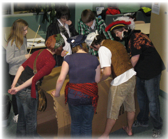
Building a ship during Pirate Night

The Medicine Hat Public Library serves as a community hub, providing equitable and convenient access to books, media, information, and programs that help to educate, enrich, entertain, and inform.