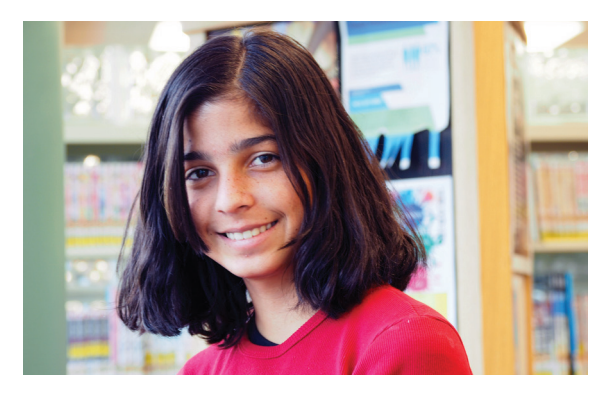
29,356 questions asked at the Info Desk