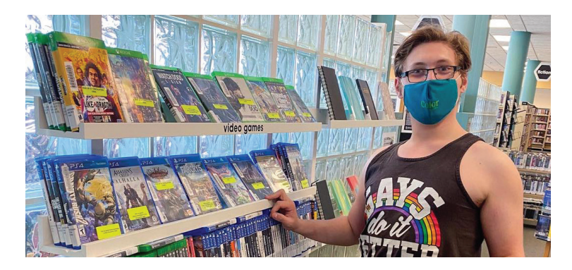
963 items circulated in the community

(books on the bus, airport, tourist information centre, women's shelter, and food bank)