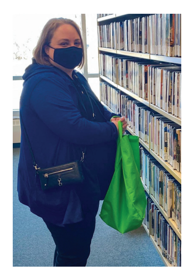
134,330 items in our physical collection 29,103 items in our virtual collection