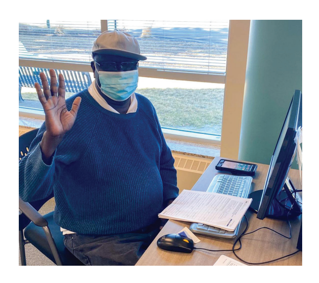
26,497 wifi sessions logged