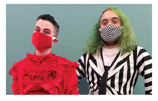
76* children's programs with 3,807 attendees