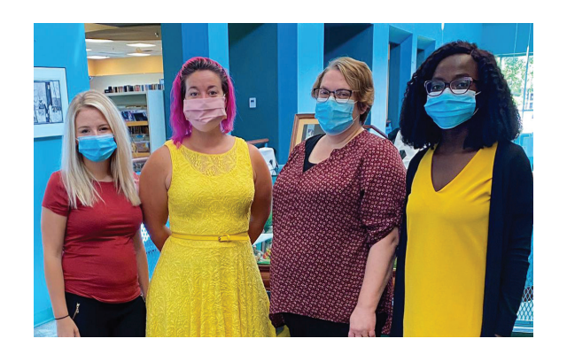
14,893 questions asked at the Info Desk